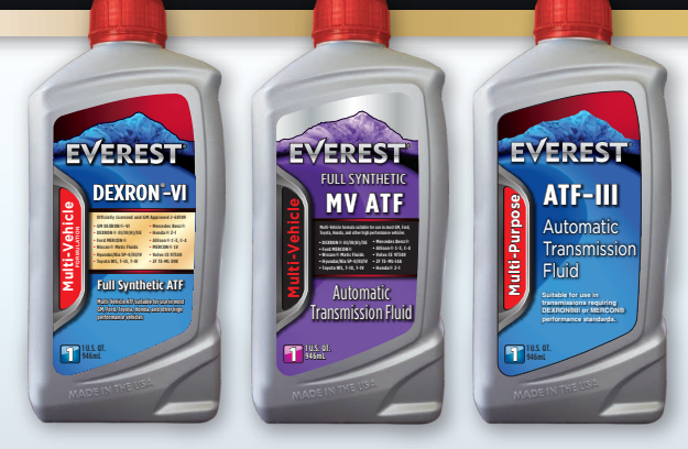
EVEREST High-Performance Automatic Transmission Fluid meets or exceeds stringent worldwide performance standards.